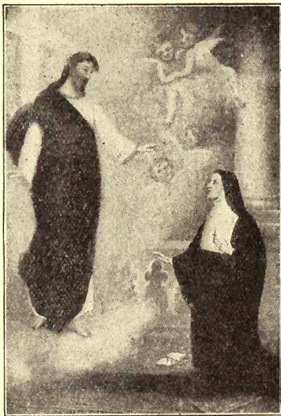
Christ Appears to St. Rita