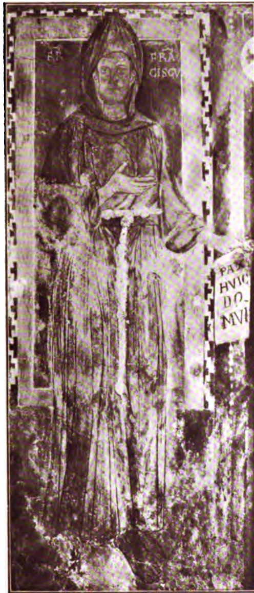
CONTEMPORARY PORTRAIT OF ST. FRANCIS OF ASSISI At the Sacro Speco, Subiaco