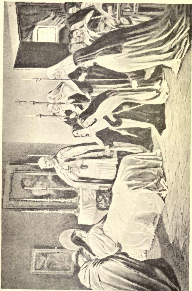
THE LAST COMMUNION OF ST. TERESA.