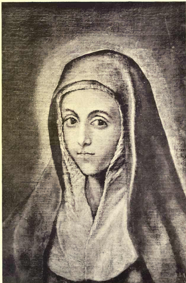
ST. TERESA IN YOUTH.