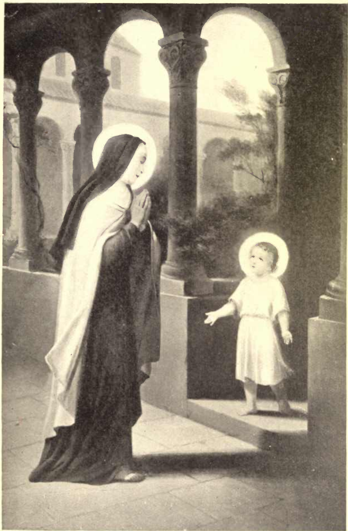
THE APPARITION OF THE HOLY CHILD TO ST. TERESA.