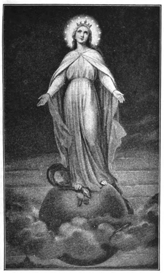
O Mary, conceived without sin, pray for us who have recourse to thee.—100 days' indulmencer rescrete and ay. www.eeak. Hiskingdom.com