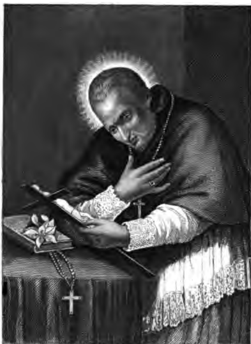
ST. ALPHONSUS MARIA DE LIGUORI, BISHOP AND CONFESSOR. Born 27 th Sept r 1696 Died 1 st August 1787. CANONIZED BY POPE GREGORY XVI, MAY 26 th 1839